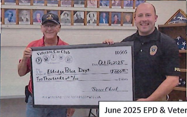
June 2025 EPD & Veteran's Car Club of the Quad Cities Car Show