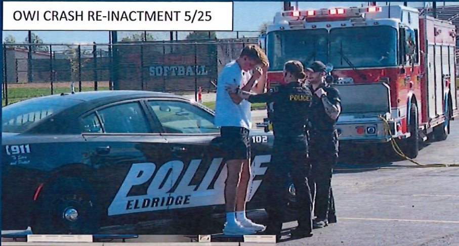
OWI CRASH RE-INACTMENT 5/25