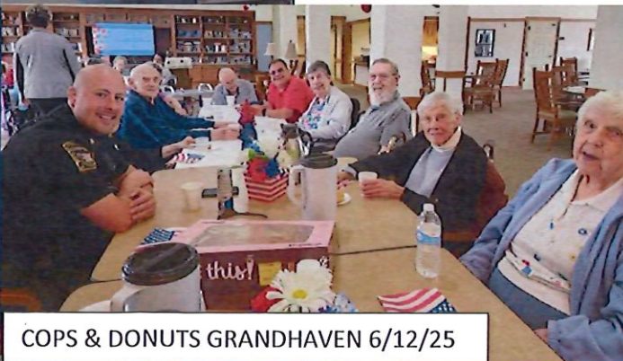
COPS & DONUTS GRANDHAVEN 6/12/25