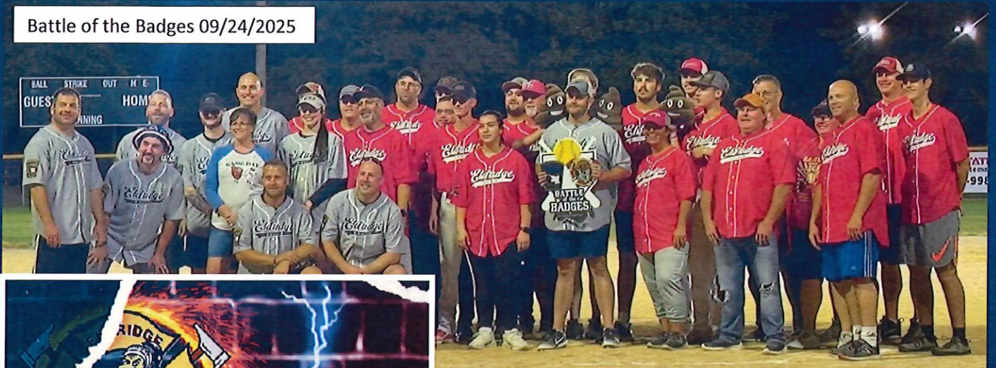
Battle of the Badges 09/24/2025